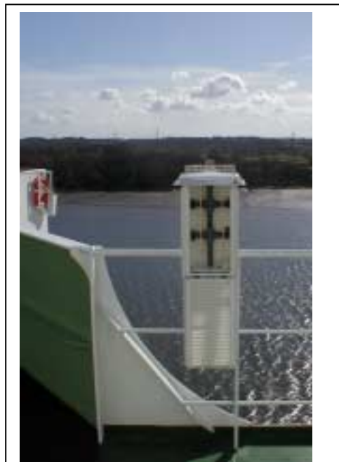
Example showing the inside of a well-exposed plastic marine screen installed on VOSClm ship P & O Nedlloyd Manet

As the volume of VOSClm data increases we will be able to increase the scope of the scientific analysis. By making comparisons with forecast model data, and averaging out any problems caused by individual ships or bad forecasts, we should get a clearer overview of the data quality. For instance, the model data has already been used to make bias comparisons with sea temperature measurements from ships using different measurement methods e.g. engine