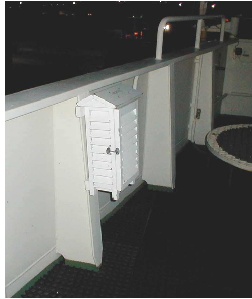
Figure 1. Examples of varying quality of screen exposure on UK recruited VOS.