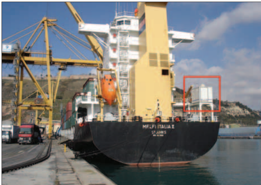
▲ Container launching: 10ft container launcher on board the Melfi Italia II