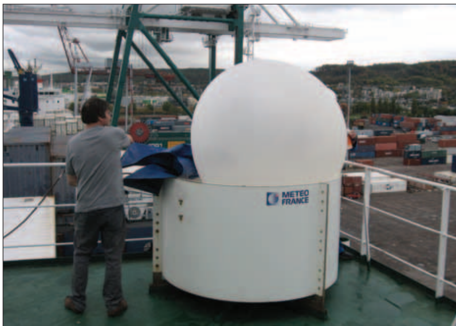
▲ Deck launching a weather balloon